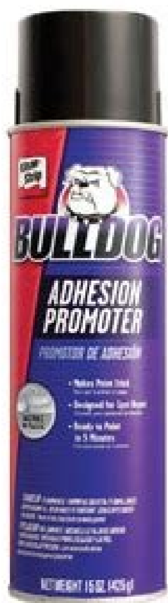
Bulldog adhesion promoter product data sheet.